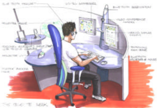
The Palette Desk (left) and the Corridor Warrior (right) – two new concepts for the 21 st Century Office

mobility and future workstyles The office of the future